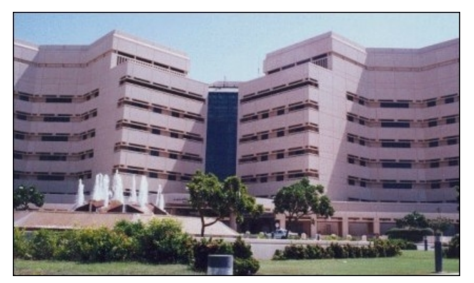
The King Abdulaziz University Hospital in Riyadh was the first teaching hospital established in Saudi Arabia. However, with only a 104-bed capacity, the hospital is representative of how far the kingdom must go to become a medical hub. Other facilities, such as those in Lebanon and Jordan, are far more advanced and readily accessible.

Riyadh no longer has the luxury of ignoring the relationship between economic and political development. The transformation into a production state is bound to create a knowledge economy and break the kingdom's tribal-based system. Long gone are the days when Saudi Arabia could enjoy a holiday from politics as a result of "the lack of binding budgetary constraints, which reduced and sometimes even eliminated the need to set spending priorities and allocate scarce economic resources."[16]