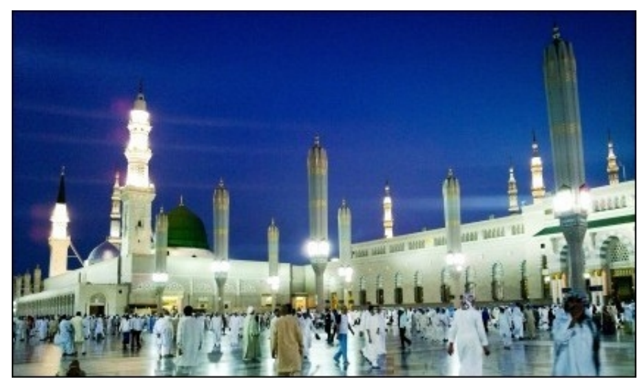
The most promising Saudi economic sector remains religious tourism. Saudi Arabia houses two of the holiest sites in Islam: The Great Mosque in Mecca and the Prophet's Mosque in Medina (above). But, the main hurdle slowing the growth of religious tourism is the Saudi reluctance to issue visas to pilgrims.

The Saudi public must somehow be made to believe in the Vision 2030 plan and to commit itself to the government's financial austerity policies; otherwise, the plan will fail. But the plan took the public by surprise. The truth remains that the ruling elite has "embarked on a path of unprecedented transformation. A key characteristic of this major effort is that it is reactive."[36]