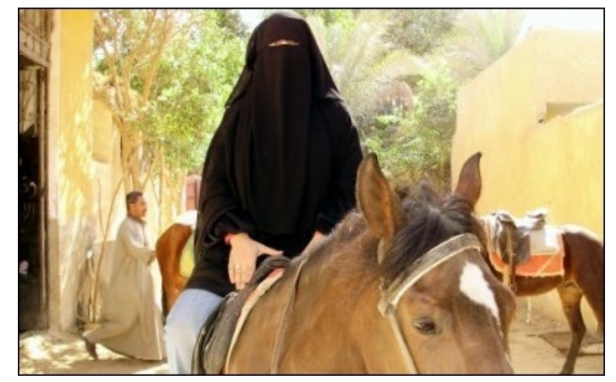
For Vision 2030 to succeed, all Saudi citizens must be able to "acquire the necessary skills to achieve their personal goals." This may be impossible in a society where family, tribal, and regional ties are strong determinates of identity and which has one of the lowest rates in the world of women in the workforce.

Riyadh's cultural values do not support the objectives of Vision 2030. Saudi society is closed, status-oriented, and tribally structured. On the whole, Saudis are not law-abiding citizens, and they often violate it with impunity. They also tend to treat expatriates, especially laborers from poor countries, as nonentities unworthy of human dignity. Sordid abuse of hapless foreign workers is the norm rather than the exception.[21] This makes it urgent to "rehabilitate the social environment to restrain shameful public behavior and total disrespect for the law."[22]