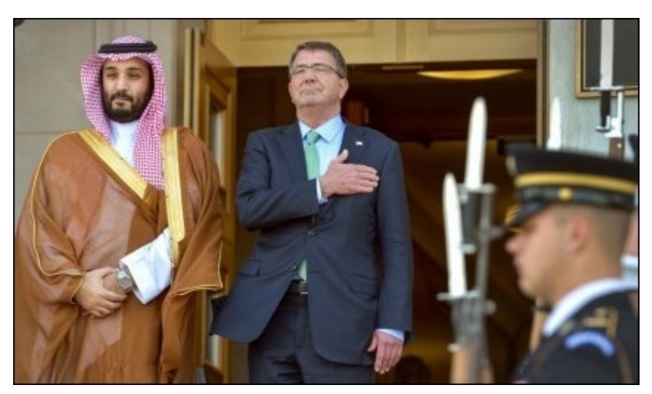
Deputy crown prince Muhammad bin Salman (left) is welcomed to the Pentagon by defense secretary Ash Carter, May 13, 2015. Salman's "Vision 2030" plan to revolutionize the Saudi economy is visionary but unsound. The plan fails to address the fact that the Saudi state rests on the three pillars of religion, tribalism, and oil.

Based on a report by the consulting firm McKinsey, the plan seeks to reinvigorate a Saudi economy that yielded an annual gross domestic product (GDP) growth of only 0.8