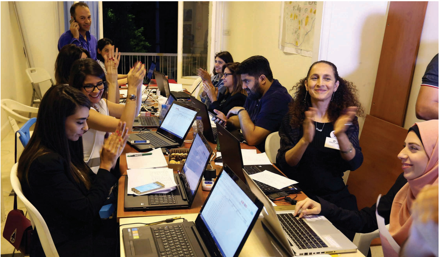
Beirut Madinati candidates and delegates cheer while monitoring ballot counts after the close of polling stations during Beirut's municipal elections in May 2016.

Lessons from Lebanon, Bahrain, Syria, and Iraq