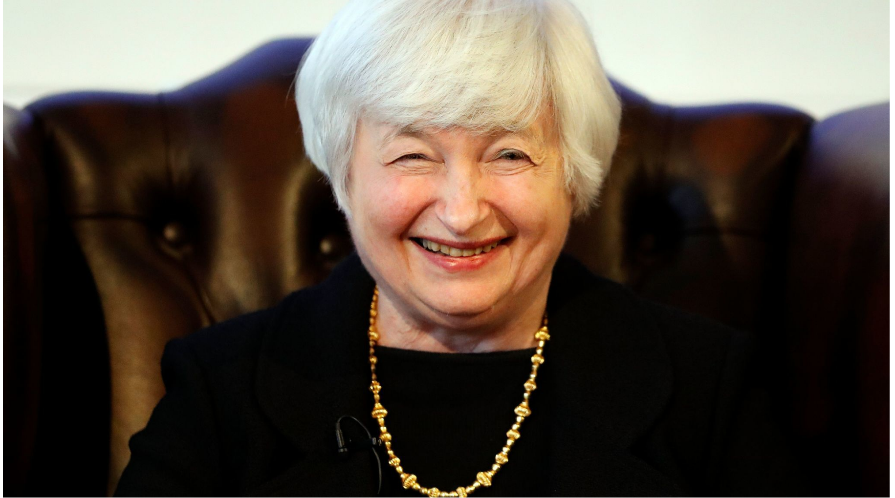
U.S. Fed Chairwoman Janet Yellen speaks during a discussion at Carlton House Terrace of the British Academy in London.

After a small rate hike in March — the second in three months and the third since late 2015 — the Fed began hinting that the process of reducing its balance sheet could happen this year. The slow buildup was designed not to rattle investors.