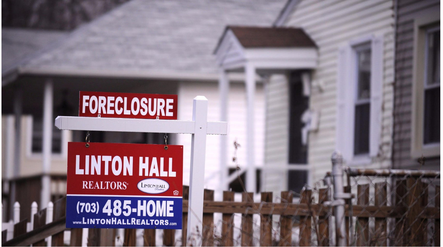
A foreclosure sign is posted in the front of a house in Alexandria, Va., in December 2008.

The 2008 financial crisis supercharged the recession that began about a year earlier, threatening to plunge the nation into another Great Depression. The Fed already was well underway in lowering its key short-term rate close to zero. But the economy remained in deep trouble.