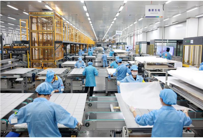
Workers at a solar-panel factory in China's Zhejiang province.