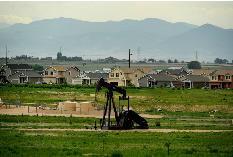
An oil derrick in Dacono, Colo.